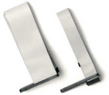
40 Pin and 20 Pin DIP Clip Cables 98-0102 and 98-0103