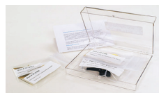
Spring Probe Kit 98-0126