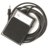
Footswitch for Older Tracker Models 98-0314