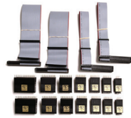
Through-hole IC DIP Clip and Cable Kit 98-0490 or 98-0591