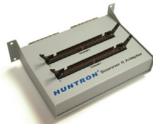
Scanner Adapter for Scanner II 98-0491