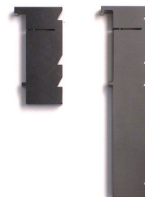
Board Spacers 98-0111 Three slot Probers 98-0292 Four Slot Probers