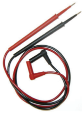
MP-20 Microprobes 98-0249