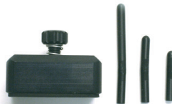
PCA Support Kit 98-0167