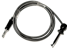
Common Test Lead 98-0043