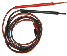
MP-10 Microprobes 98-0078