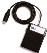
Footswitch for Model 30, TrackerPXI, Tracker 3200S Tracker 2800/2800S 98-0315