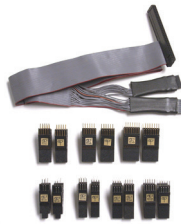
SMT SOIC Clip and Cable Kit 98-0543 or 98-0544