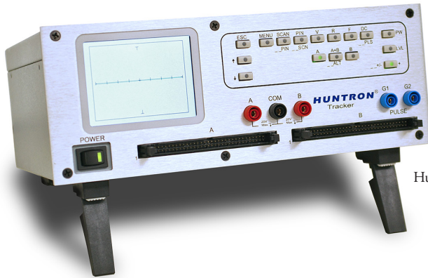
Huntron Tracker 3200S

The NEW Huntron® Tracker® 3200S is designed to encompass our product history and leadership in power-off test by providing powerful test and troubleshooting solutions.