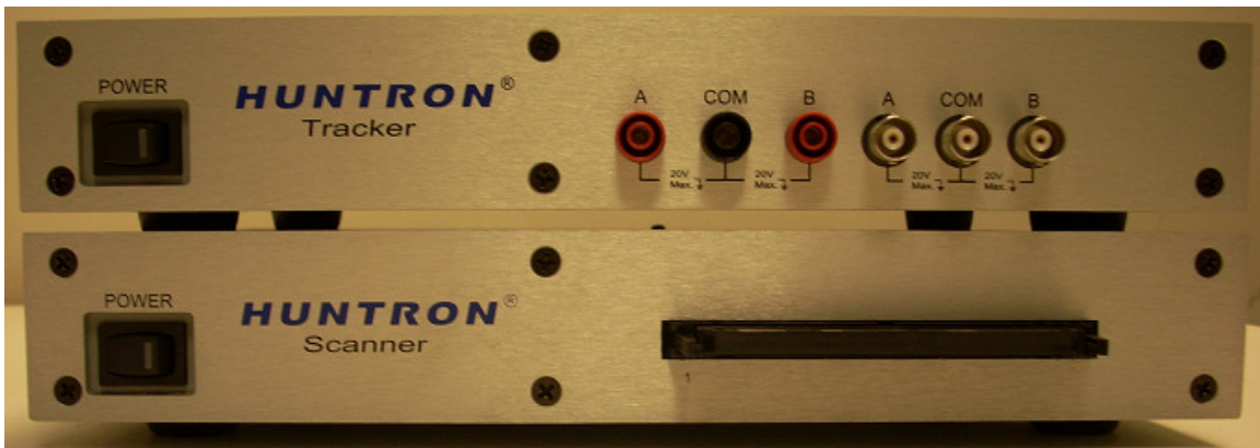
Figure 1-1. Huntron Tracker Model 30 and Scanner 31S

The Huntron Scanner Model 31S, shown in Figure 1-1, has been designed as a compatible interface for the Huntron Tracker Model 30. Together, they create an effective test system for component troubleshooting. The Scanner 31S allows faster comparison testing of components and boards by the use of direct cabling and optional IC clip cables for in-circuit ICs (integrated circuits).